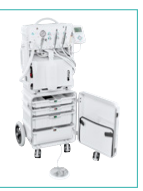
4 drawers for instruments/ consumables Separation red and green zone