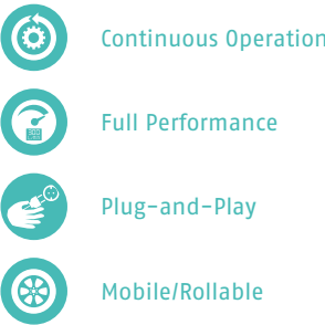
Suction units Master-Vac & Pro-Vac

PRO-VAC: The fully stand-alone suction cart PRO-VAC makes your work easier with a three-way syringe and an impressive suction capacity (300 l/min) that outperforms many fixed units. Its compact design helps the dental team to efficiently maintain optimal hygiene. The workflow in the dental clinic is made easier by the integrated amalgam separator. Maximum flexibility combined with highest performance and comfort.