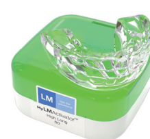
My LM-Activator™ High Long ●