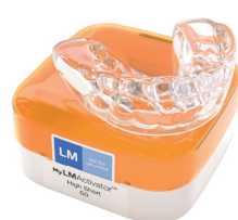
My LM-Activator™ High Short ●