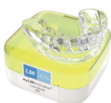
My LM-Activator™ Low Short ●

My LM-Activator™ is the new product line of LM-Activator™. With streamlined and lightweight design combined with further optimized features and morphology it is continuing the established path of LM-Activator™. Experience both enhanced comfort and optimized fit in the new My LM-Activator™. The most common models and sizes for your patient are easy to find.