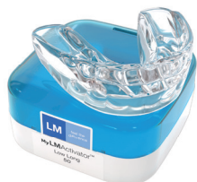
My LM-Activator™ Low Long ●